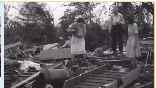
June 14, 1945 tornado film

As segments of the DVD were shown during our Zoom program, clips from the DVD are shown to the right.