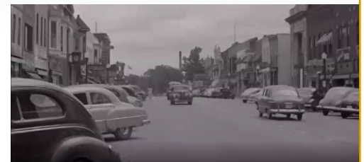
Princeton City of Elms 1948