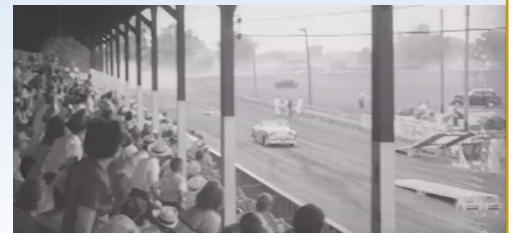
Bureau County Fair 1949 Jimmy Lynch Hell Divers