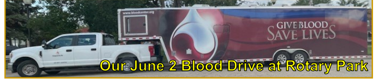
Our June 2 Blood Drive at Rotary Park