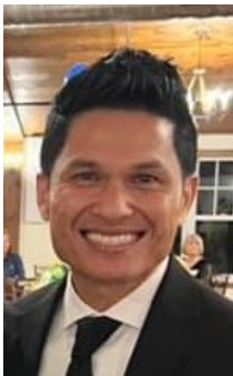
February 8 Program Chantha Chhim Bunker Hill Church

The meal option is soup/salad bar unless each Rotarian selects another choice on our webpage at www.princetonrotaryclub.com or sends an email to Rita at undergroundinn@gmail.com by 3:00 p.m. on Monday with one of the following options: Meatloaf & Mashed Potatoes Grilled Chicken Lettuce Salad Turkey Wrap & Fries (or Chips) Hamburger & Fries (or Chips) Chicken Salad Sandwich & Chips (or Fries) Deep-Fried Tenderloin & Fries (or Chips) All Rotarians choosing one of these options pay $11 for the meal to Rotary who pays the Underground. Drink price: $3 for someone not eating.